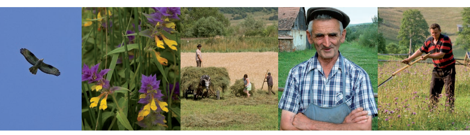
Conservation, traditional land management, local incomes

ADEPT has funded and coordinated research by international and Romanian specialists leading to the establishment of Târnava Mare as one of Romania's largest lowland Natura 2000 areas, under which local people receive EU support for conservation.